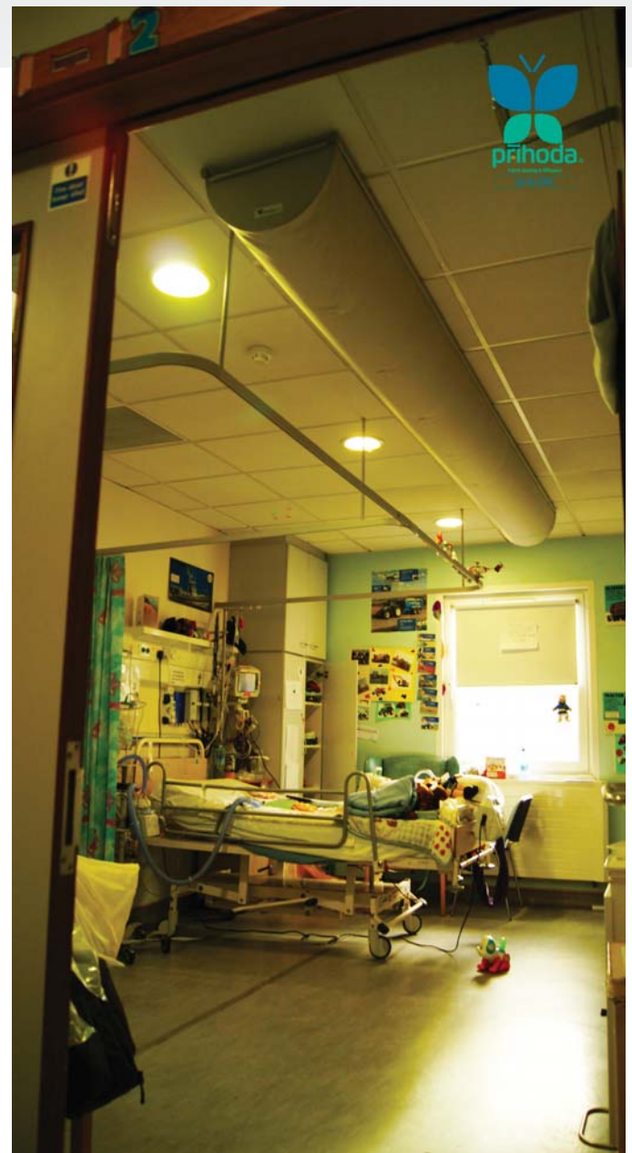
Přihoda Low Velocity Fabric Ducting

Our thanks to Crossflow Air Conditioning for specifying Přihoda and for facilitating this Project Profile