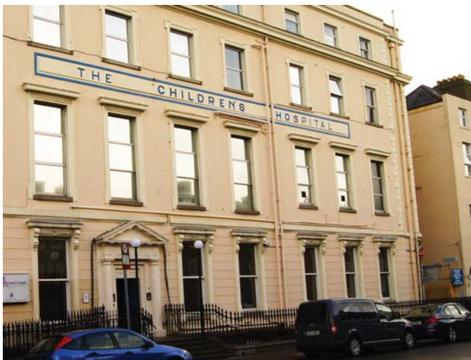
Temple Street Hospital Facade

This beautiful old manison, now one of Dublin`s most recognised buildings has been in continuous use as a Childrens Hospital since it first opened it`s doors in Temple Street in June 1879. The seven major specialities at Temple Street today include neonatal and paediatric surgery, neurology, neurosurgery, nephrology, orthopaedics, ENT and plastic surgery