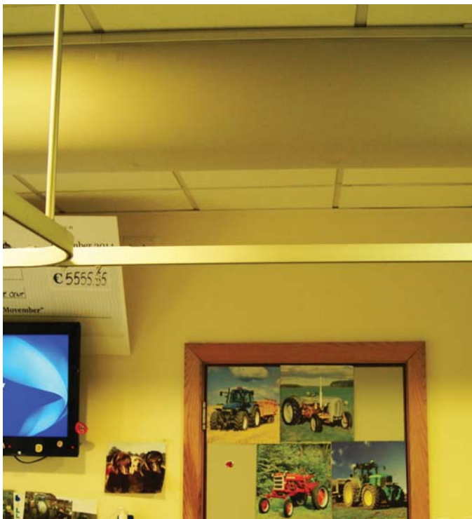
Designed to blend into the room