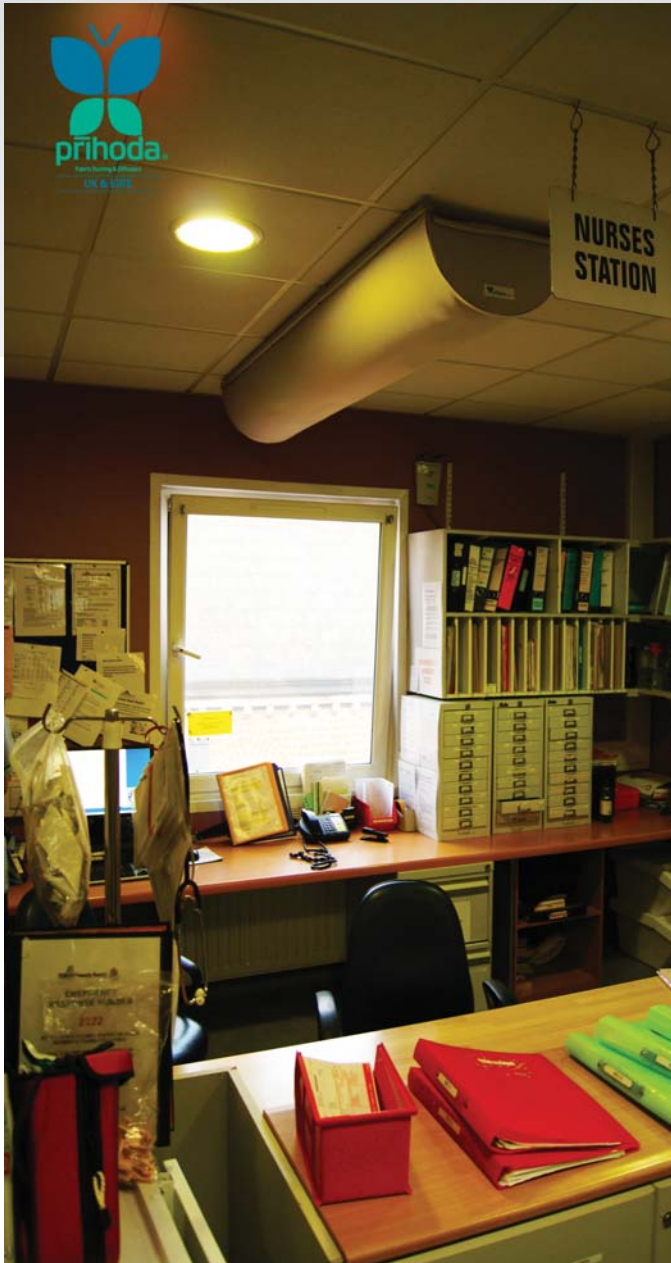
Nurses Station Cooling